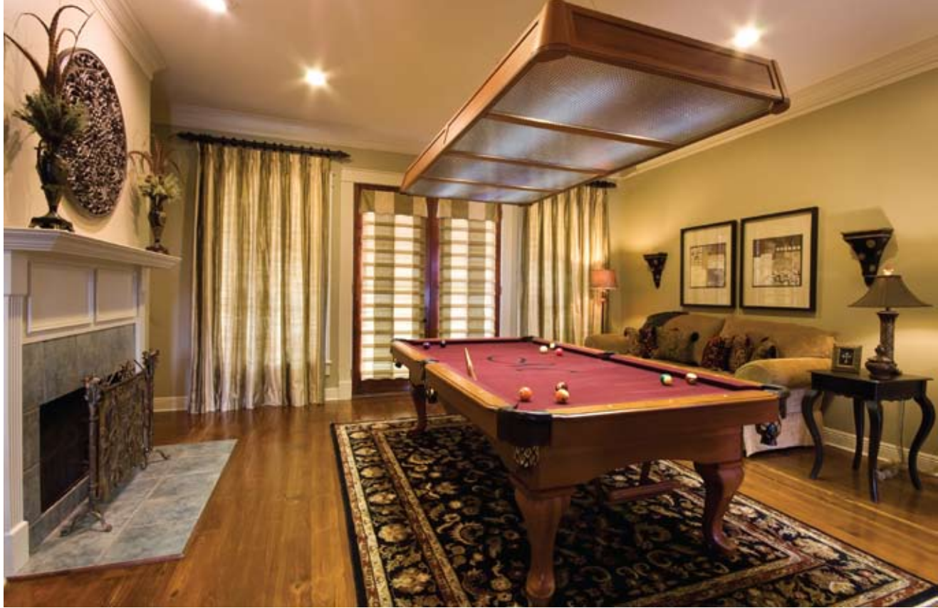
This Stine Game Table pool table was formerly housed upstairs, but the Millers and their designer relocated the table downstairs where it breathes new life into the living room.